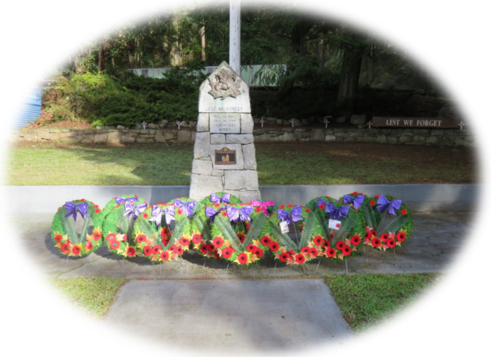
Cenotaph at Pender Island