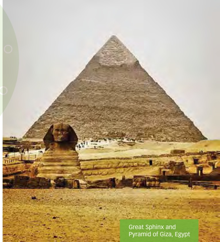
Great Sphinx and Pyramid of Giza, Egypt

Cruising the world's waterways has many perks and offers a different perspective