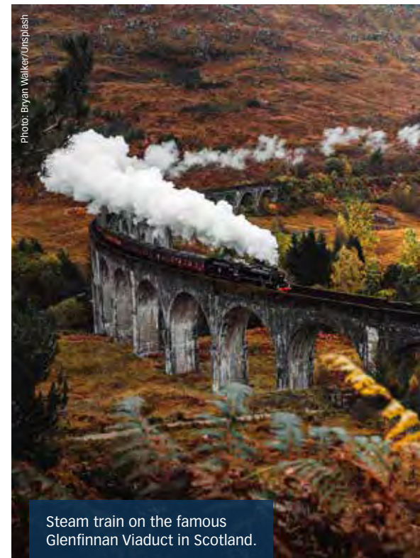
Steam train on the famous Glenfinnan Viaduct in Scotland.