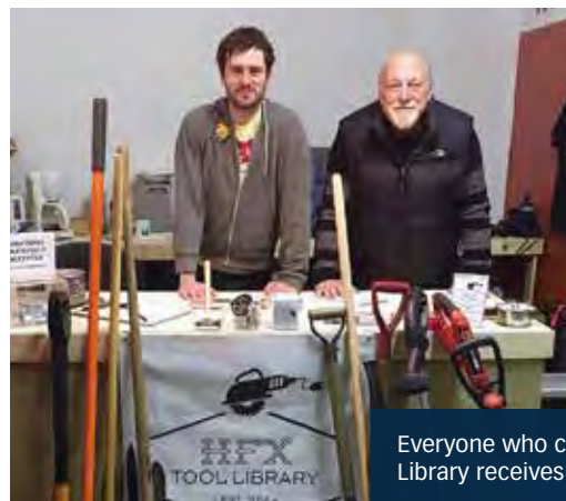
Everyone who comes to the Halifax Tool Library receives personal instruction.