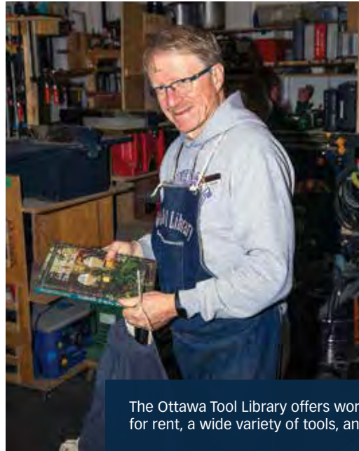
The Ottawa Tool Library offers workshops, a workspace for rent, a wide variety of tools, and lots of support.

Sharing tools, much like sharing a bike or car with others in a rideshare program, reflects a desire to be both practical and economical. While some people are constantly working on a project that requires tools of one kind or another, most people have a project they’re hoping to complete, and once it’s done they may or may not use them ever again. Tools then sit gathering dust in the shed, garage, or attic.