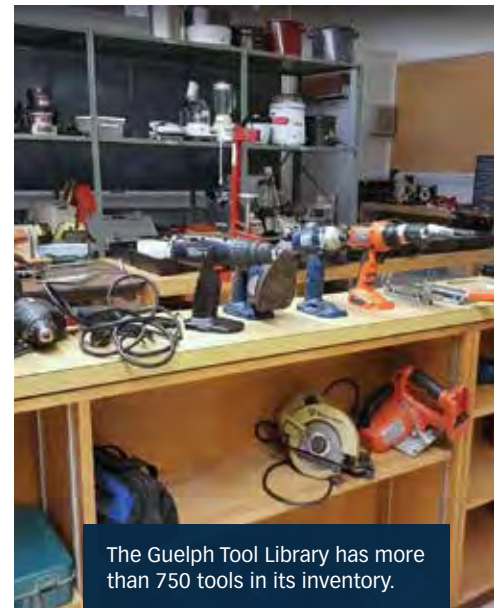
The Guelph Tool Library has more than 750 tools in its inventory.

The impact on individuals looking to save some money, access tools they only need once, and learn more about the use of the tools they’re using is significant. So is the environmental impact. “The tools we keep out of the landfill are unbelievable,” notes Vollmerhausen. The Ottawa Tool Library takes old, broken tools and strips them down. To date, 1.6 tonnes of metal have been diverted from local landfills.