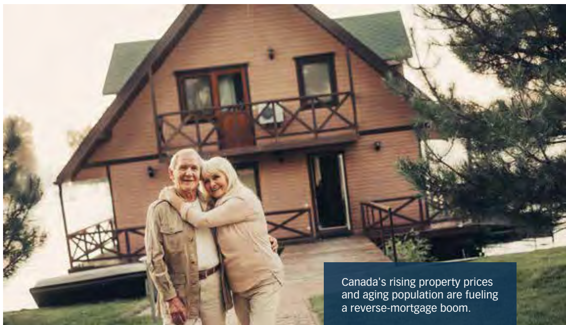
Canada's rising property prices and aging population are fueling a reverse-mortgage boom.

Reverse mortgages work similar to a home equity line of credit. However, instead of paying interest monthly, no payment is required, though you can usually pay down the loan without a penalty. The bank places a charge against the home, similar to a conventional mortgage, to secure the loan, but does not collect on it until you die, move out, or sell the property. If one spouse dies, the other can remain in the home provided he or she was included in the loan application, which is why it's important that both spouses apply for the loan.